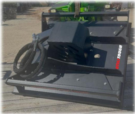
Removable Bolt-on Protection Shield